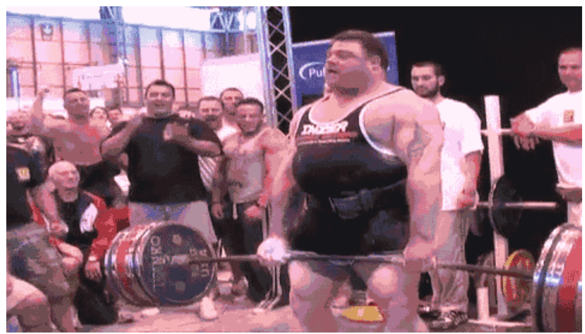
Not a IYI